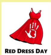
RED DRESS DAY

May is Asian Heritage Month, Dutch Heritage Month and Speech and Hearing Heritage Month