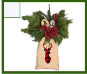
Hanging Greenery Bough Greenery that is versatile! A fun, vintage burlap bag holds premium greens and red ilex berry branches. Completing the look are holiday picks like a bow and a pinecone. Lean it up against stairs, benches or your home and hang from your door.