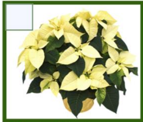
6.5" Premium Poinsettia A Holiday Favourite! Brighten up any room this winter with a vibrant poinsettia. Available in red and white, the poinsettia is perfect for your home, hotels, restaurants and banks over the holidays.

6.5" pot: 14 to 16" tall and 13 to 16" wide