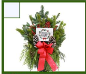
Outdoor Greenery Arrangement Welcome your guests in from the cold with this large, beautiful and fresh holiday greenery arrangement. Pinecones, berries and a large red bow complete the festive look. Standing at 2 feet tall this statement piece is sure to inspire the joyful spirit!