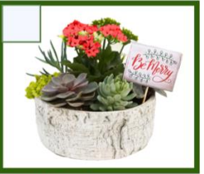
Succulent Bowl A beautiful, ceramic, patterned bowl is 9" in diameter. Perfect for your coffee table or as a holiday gift. An assortment of popular succulents are planted with a flowering Kalanchoe in the center.