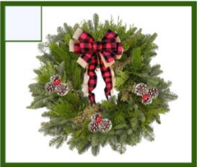
Holiday Wreath A Holiday Wreath is a classic door upgrade. Fresh noble, cedar and juniper decorated with a large plaid bow, frosted pine cones and red berries are sure to give you and your guests a homey warm feeling from the outside.