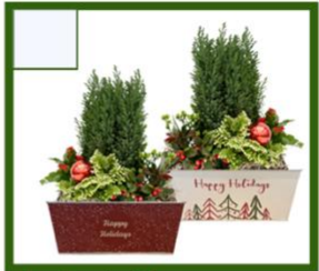
Indoor Tropical Planter Add a festive look to your table with a mixed tropical planter. There are four different plant varieties planted in these rectangular holiday themed tins. Planter container designs do vary and cannot be requested.