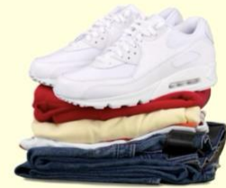
Extra clothes Layers