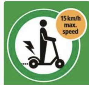
Speed Limit on Paved Shared Pathways

Generally, the rules of cycling in BC apply to the use of an E-scooter on a permitted road in a pilot community.